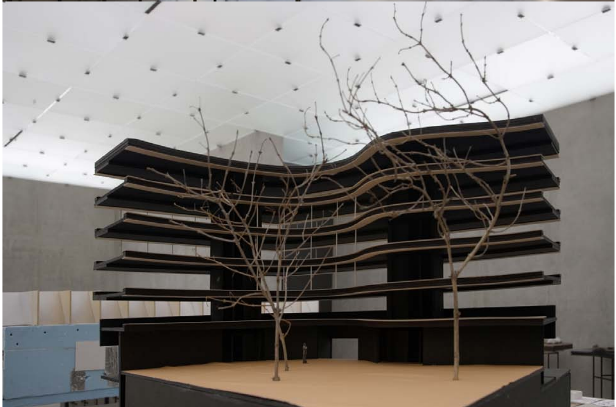
Kunsthhaus Bregenz exhibition