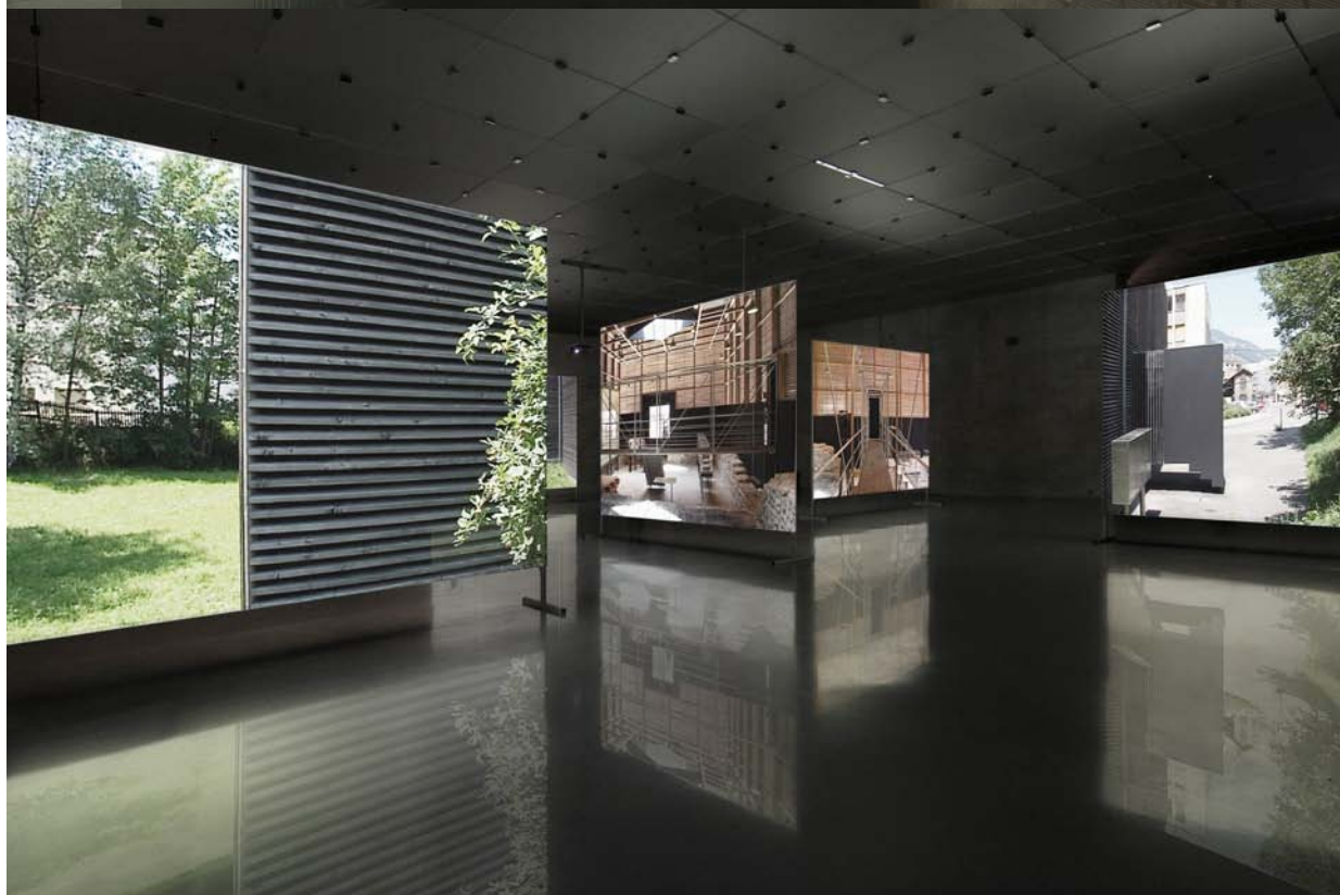
Kunsthhaus Bregenz exhibition