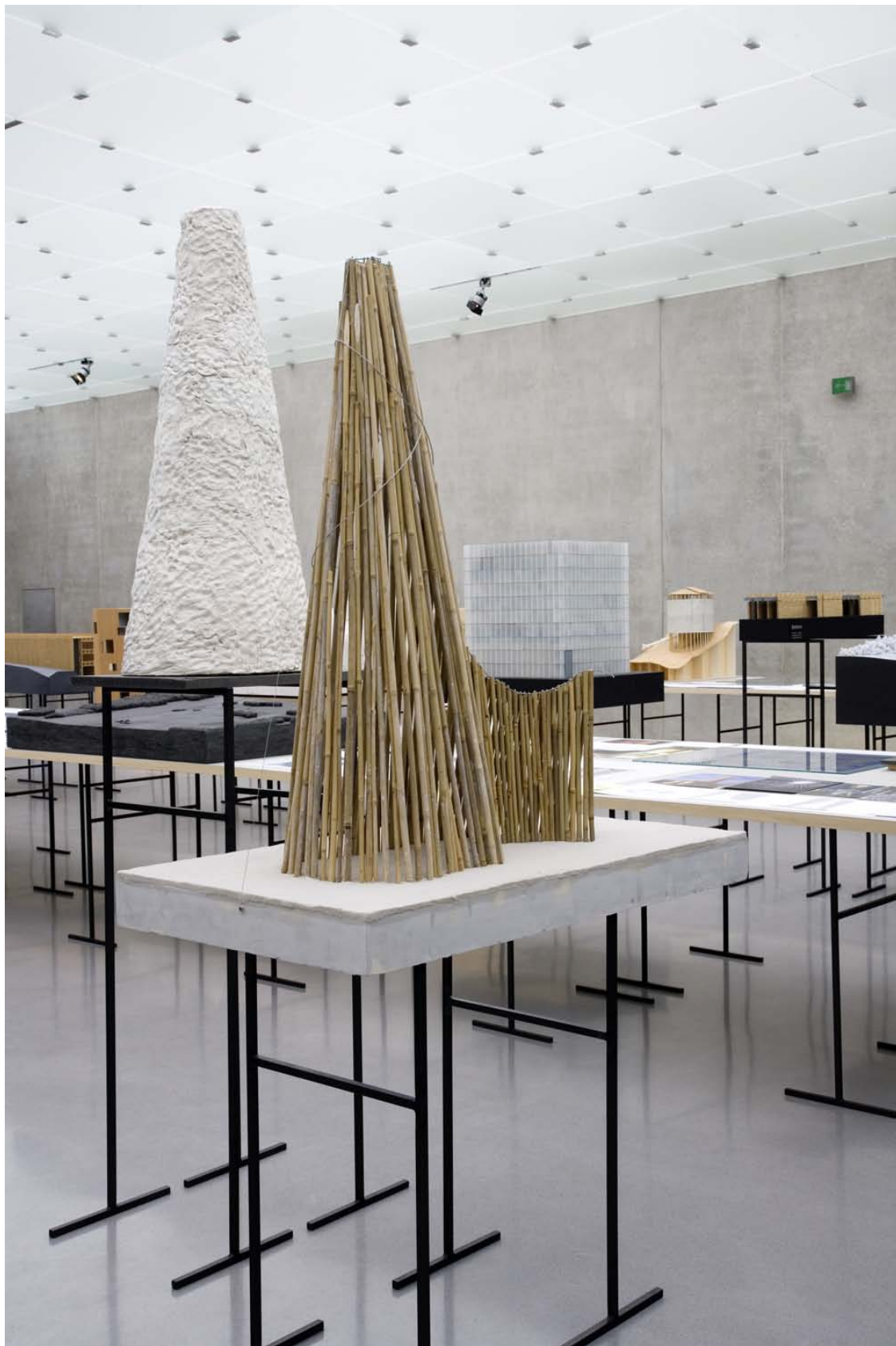
Kunsthhaus Bregenz exhibition © Peter Zumthor, Kunsthhaus Bregenz