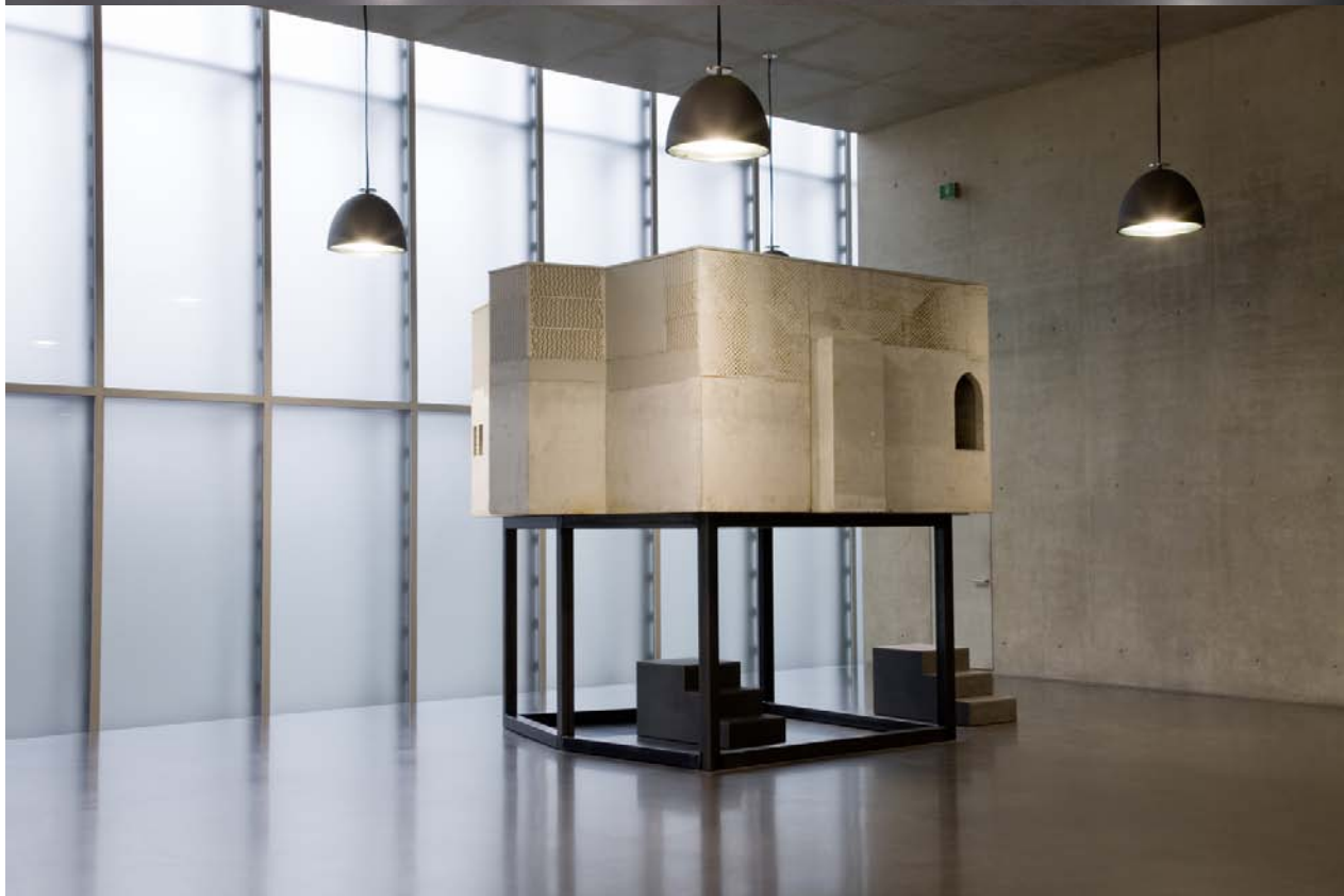
Kunsthhaus Bregenz exhibition