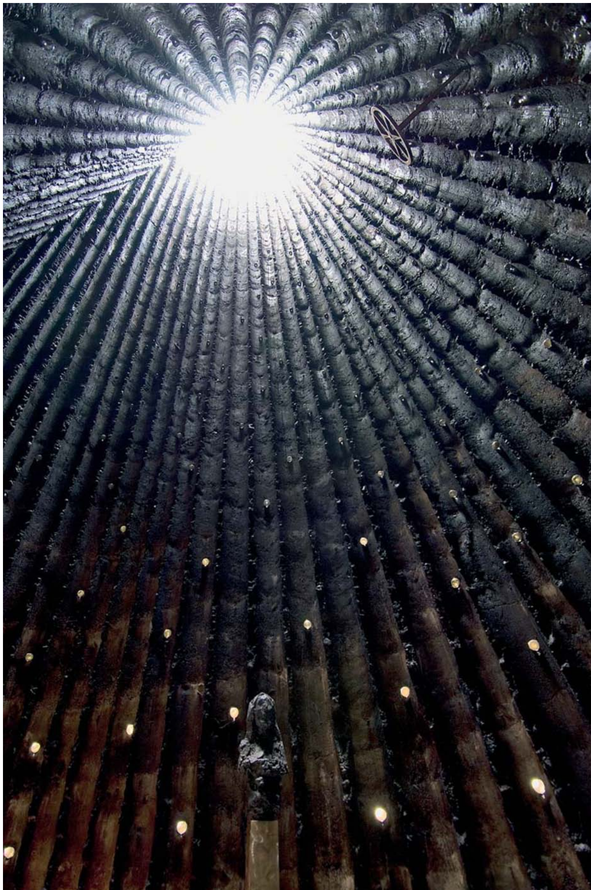
Peter Zumthor Feldkapelle Bruder Klaus, Wachendorf, Eifel, 2007