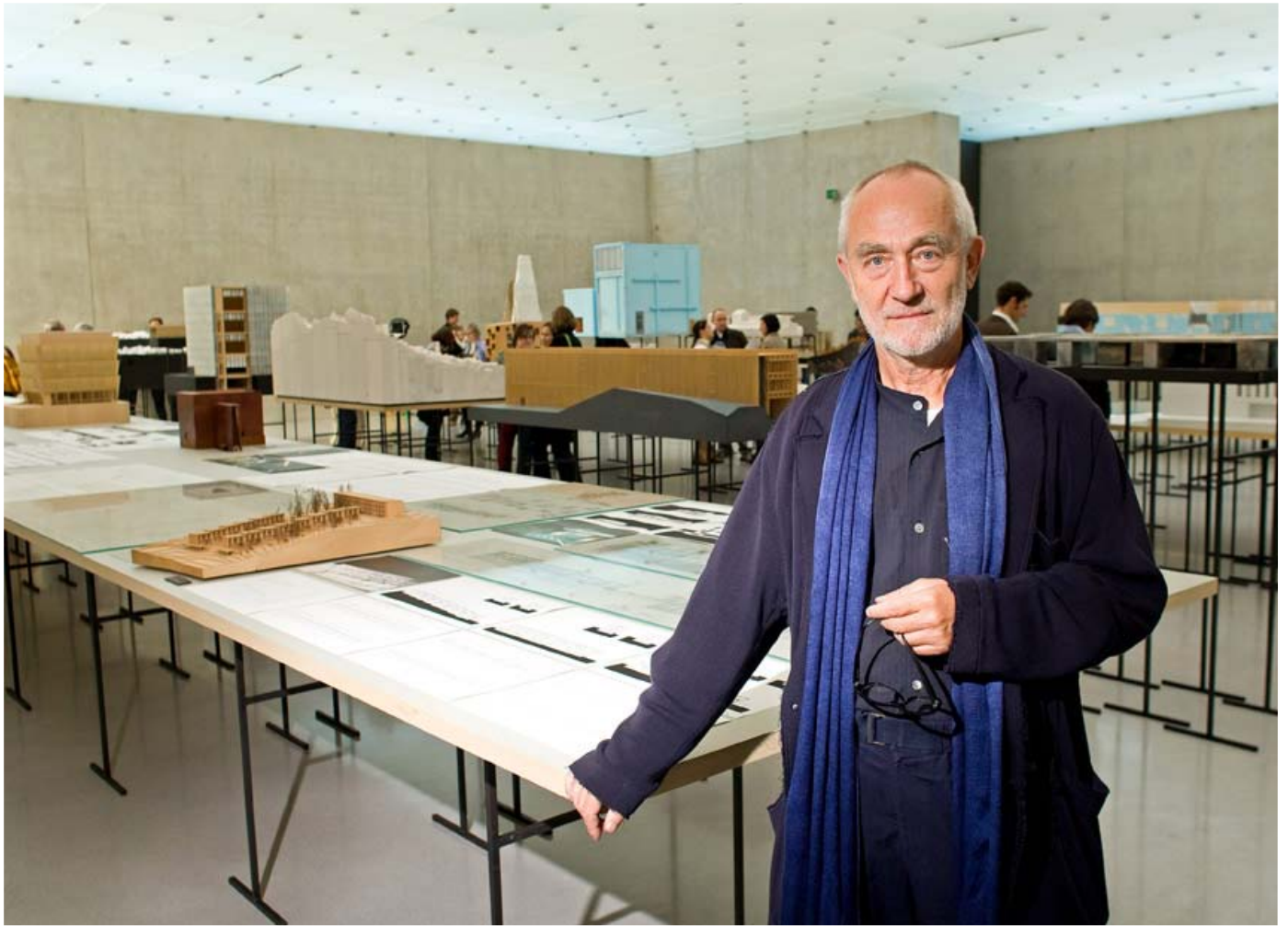
Peter Zumthor