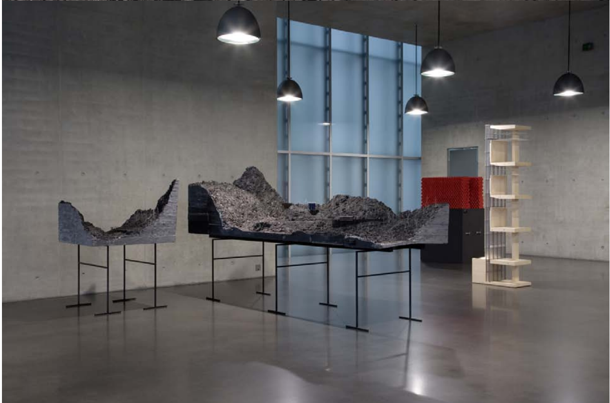
Kunsthhaus Bregenz exhibition © Peter Zumthor, Kunsthhaus Bregenz