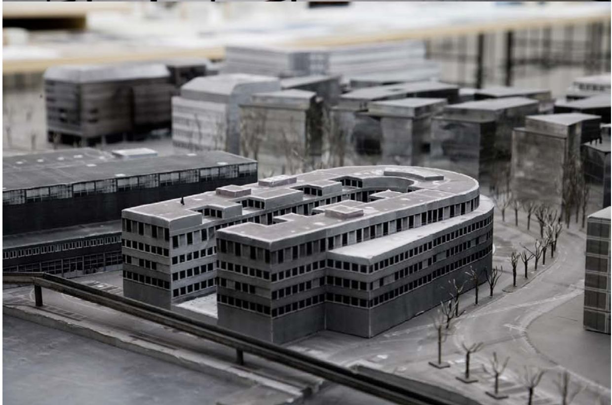
Kunsthhaus Bregenz exhibition © Peter Zumthor, Kunsthhaus Bregenz